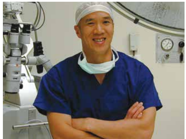
Dr Charlie Teo AM, NSW.

Dr Teo is a neurosurgeon and the founder of the Cure for Life Foundation which funds research into brain cancer. For more information on the Cure for Life Foundation visit cureforlife.org.au .